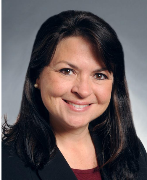
Senator Susan Kent